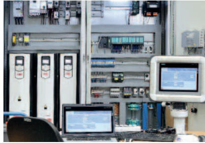
Customized solutions are tested in our test center