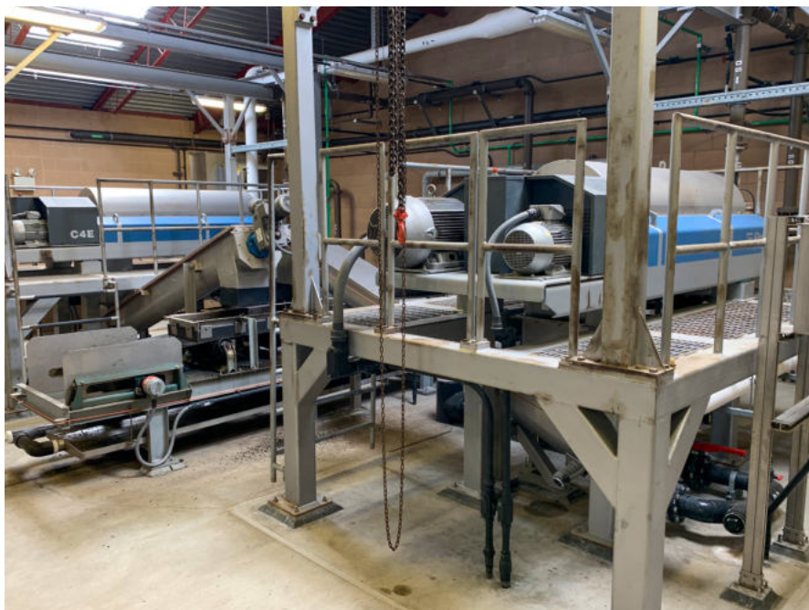
The Northern plant was outfitted with new Flottweg centrifuge decanters.

"We have absolutely no problems with the centrifuges. The only issue has been